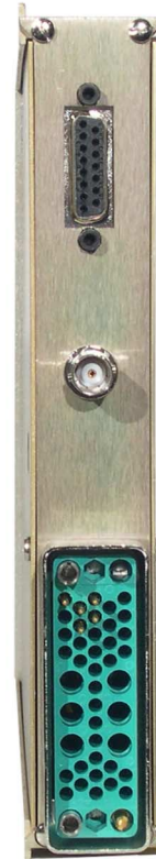
SR255 rear panel